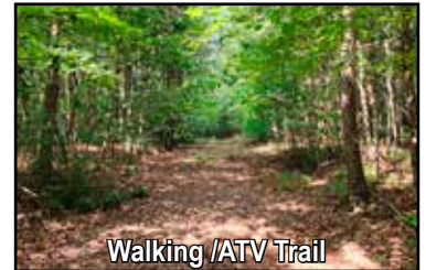
Walking /ATV Trail