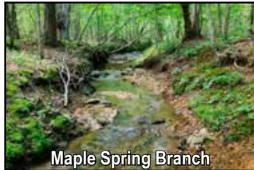
Maple Spring Branch