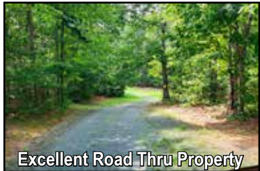
Excellent Road Thru Property