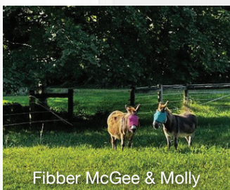
Fibber McGee & Molly